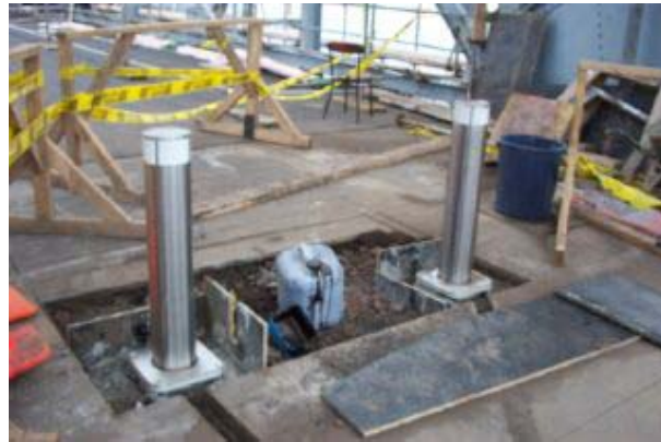
Installation of Pneumatic bollards in progress.