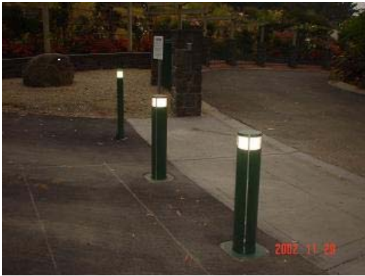
Stainless Steel bollards powder coated with custom lighting.